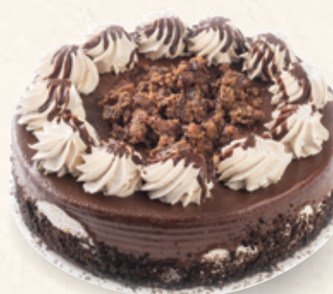
Chocolate Peanut Butter Cheesecake