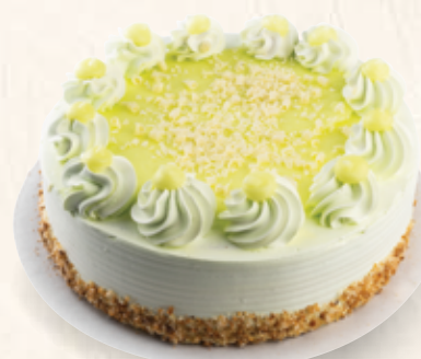
Key Lime Cake