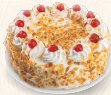
Italian Rum Cake