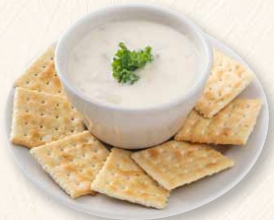
NEW ENGLAND CLAM CHOWDER