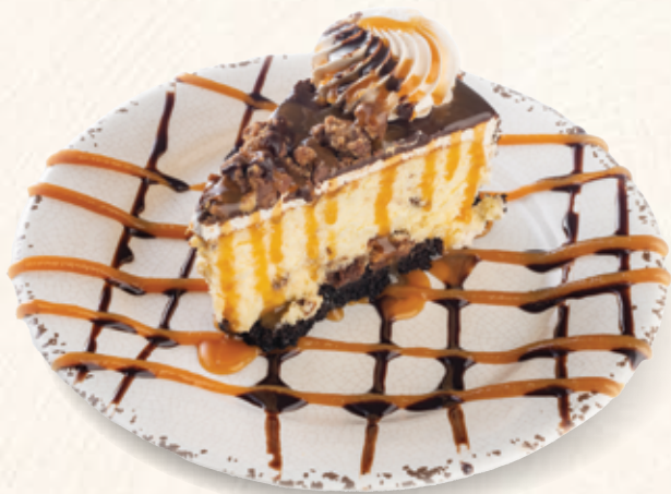
Chocolate Peanut Butter Cheesecake

Choose the perfect sweet ending. For pricing and availability, please ask your server. Whole cakes are available for special events!