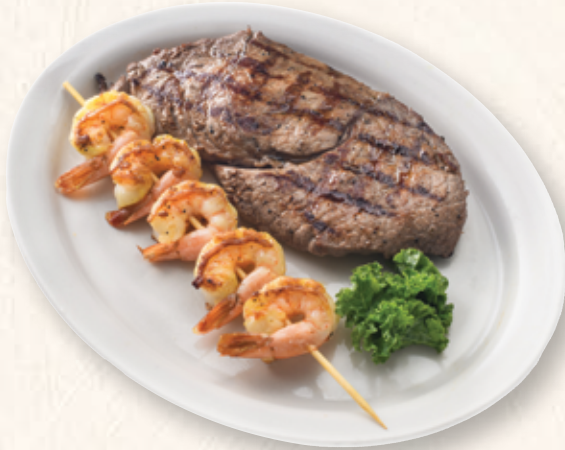
SIRLOIN STEAK & SHRIMP