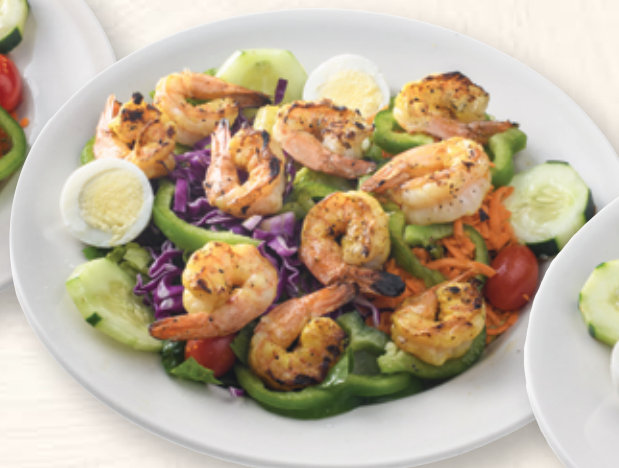
GRILLED SHRIMP SALAD