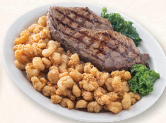
SIRLON STEAK & BABY SHRIMP