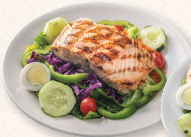
GRILLED SALMON SALAD