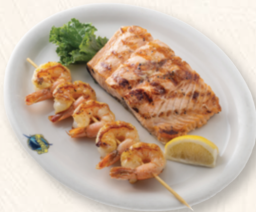
SALMON & SHRIMP

Fried Canadian Flounder & Baby Shrimp Boneless and skinless – 14.49