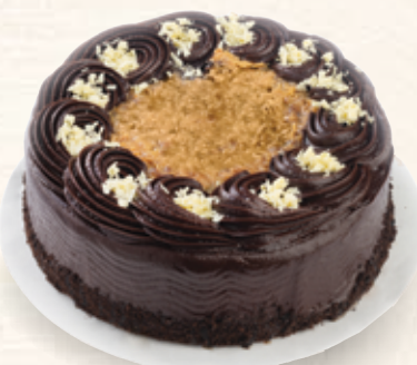
German Chocolate Cake