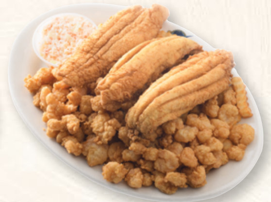
BABY FLOUNDER & BABY SHRIMP