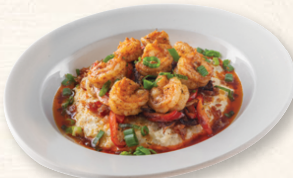
NEW SHRIMP & GRITS