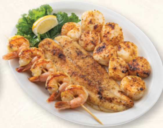
NEW COMBO PLATE