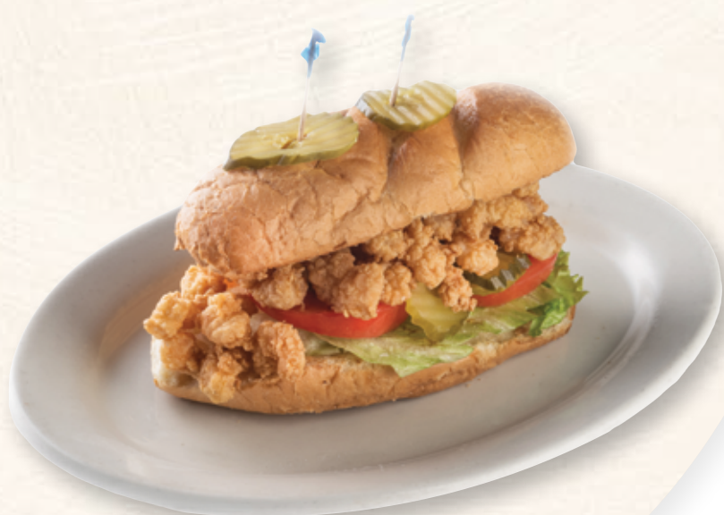
SHRIMP PO' BOY

All Sandwiches and Po' Boys come with FREE Tea