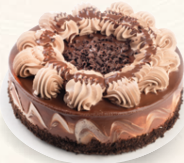
Chocolate Mousse Cheesecake