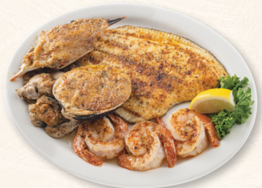
BROILED SEAFOOD PLATTER

Perch fillet, deviled crab, jumbo shrimp and select oysters – 19.99 No substitutions, please.