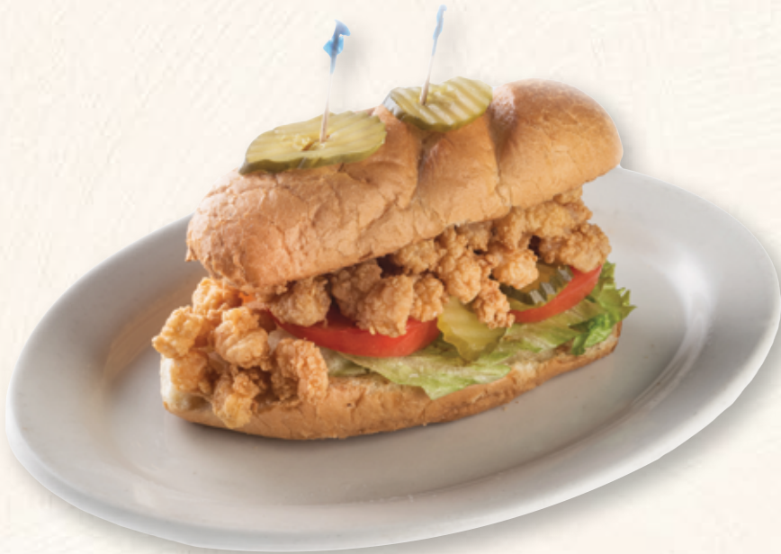
SHRIMP PO' BOY